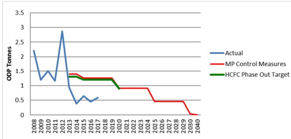
Graphic 1: Mongolia scheduled and actual consumption

In 2016, the NOU conducted the ODS Alternatives survey and HFC Inventory to understand the consumption trend of alternatives to HCFC and identify opportunities for the introduction of low global warming potential (GWP) technologies in Mongolia. The studies showed that from 2012-2015 there was at least 21 types of HFC used of which the highest consumption was of HFC-134a and R-410A. Low-GWP options include R-744 (carbon dioxide) and R-704 (helium). There is an increasing trend of imports of new types of equipment such as vending machine, refrigerated milk tank, printing paper transformer, gas bag and skating equipment that depend on HFCs.