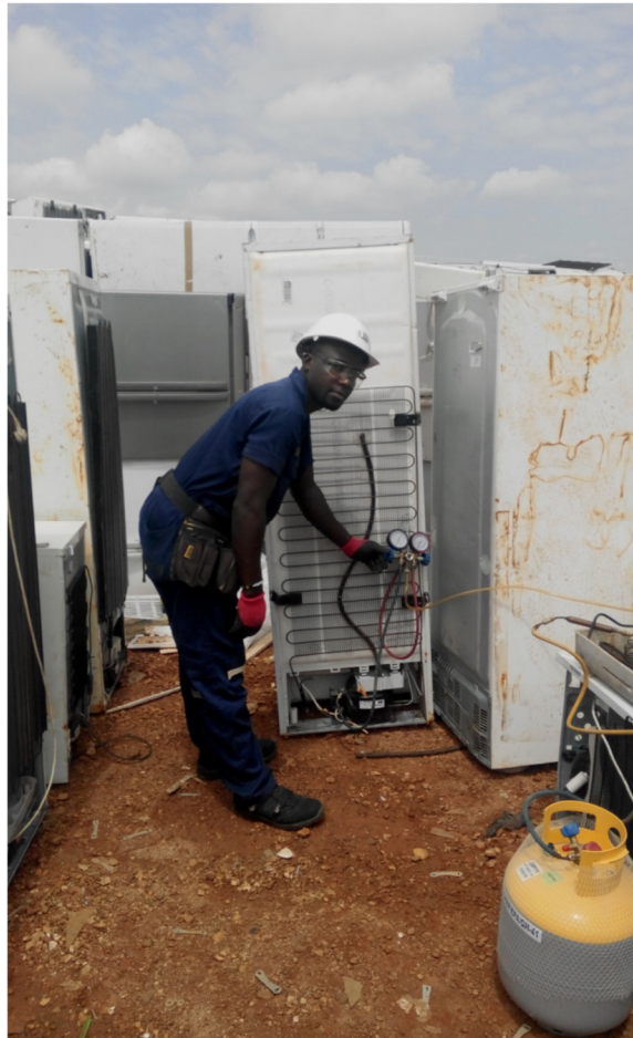
Staff at the Presank facility

The Presank Company mainly degassed and dismantled the seized refrigerators and freezers, while the CWMC was collecting, and storing the rebate refrigerators in their new yard in Afiamang for future degassing.