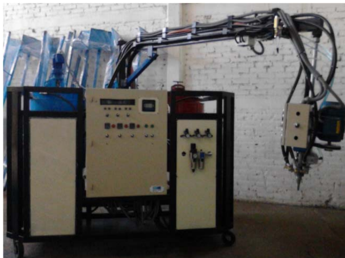
Low cost ISF Foam Dispenser, developed by Zadro/Mexico

b) For integral skin equipment a similar program will be based on a previous attempt to economize equipment in Mexico for that particular purpose: