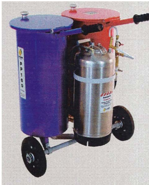
Pumer-1000 DT medium pressure injector

UNDP therefore looked in the market for equipment that would fit better the purpose of PIP applications. Equipment found suitable—albeit not ideal—was equipment from Pumer/Brazil (see picture below):