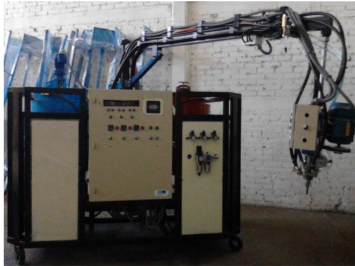
Low cost ISF Foam Dispenser, developed by Zadro/Mexico

B. For integral skin equipment a similar program will be based on a previous attempt to economize equipment in Mexico for that particular purpose: