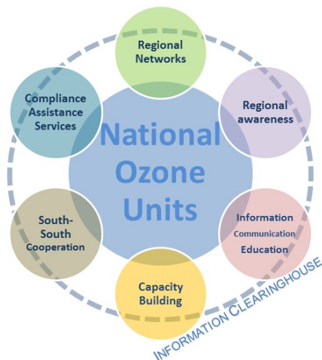
Figure 1 - Services delivered by CAP to Article 5 countries

CAP has mobilized funding and partnerships to assist countries to adopt alternatives and approaches to achieve climate co-benefits (see Annex 1D for more details).