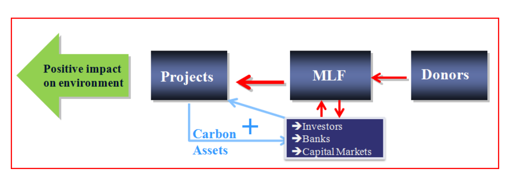
Figure : Financing HCFC Phase Out Co-Benefits

The above cannot be considered without looking at what sources of funding could be available broadly. There are a number of sources for grant financing and concessional or commercial lending as well that should be sought to complement MLF funding particularly where MP projects intersect with the climate agenda, in order to maximize ozone and climate benefits. These include the Global Environment Facility, bilateral, the Climate Investment Funds including the Clean Technology Fund, IBRD/IDA lending and the Green Climate Fund in the making, or even instruments such as green bonds.